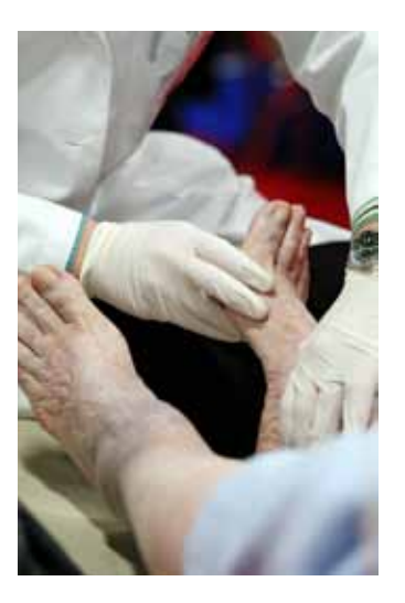
Comprehensive foot exam. Peripheral nerve and vascular damage in diabetes interferes with sensation and healing from tissue injury, heightening risk for amputations. Research is moving forward on treatments to control infections and promote or restore healing.

new tools and techniques for assessing complications. Skin autofluorescence shows promise as a noninvasive surrogate marker for AGE formation in the pathogenesis of diabetic complications. Skin intrinsic fluorescence levels can predict cardiovascular morbidity and mortality and kidney disease in people with diabetes. Diabetic peripheral neuropathy has two new tests under development that eventually may enhance the potential for identifying therapies. These tests, skin biopsies and corneal confocal microscopy, assess the structure of distal terminals of sensory neurons and quantify small fiber nerve damage in minimally invasive or noninvasive assays. Biochemical risk factors, vascular imaging, and stress testing can help to define CVD risk in persons with diabetes. Continued efforts to test and develop biomarkers, tests, and other tools to detect diabetes complications will be important for prevention and treatment of these conditions.